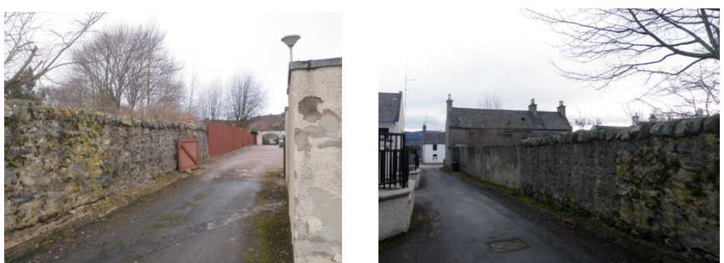
Figs. 11 and 12 – existing boundary treatments on the northern boundary of the proposed site

69. In terms of the two proposed semi detached dwellings within the existing lawned area of the hotel grounds, the lack of design detail again presents difficulties in considering whether or not this area of the site is capable of accommodating this type of development. The physical space available suggests that two dwellings could potentially be accommodated in conjunction with the provision of adequate levels of private open space, on site car parking and access arrangements. The separation distance between the proposed semi detached blocks on the site and neighbouring properties on Mossie Road is acceptable and exceeds the accepted minimum standards. Despite this however, the full impact of the development on neighbouring properties cannot be established in the absence of design details. Ground levels are marginally higher in this area relative to lands to the northwest and west of the site. Consequently dwelling house designs with upper floor accommodation could potentially give rise to overlooking and adversely impact on the residential amenity of neighbouring properties.