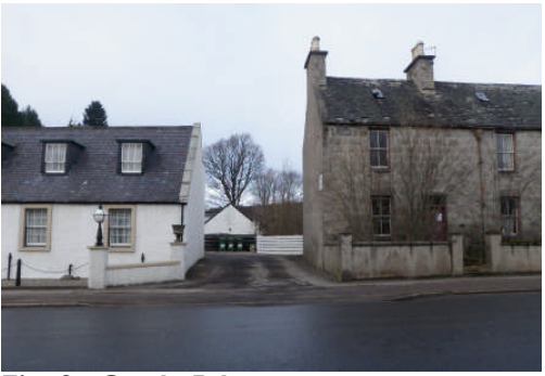
Fig. 8 : Castle Rd. access