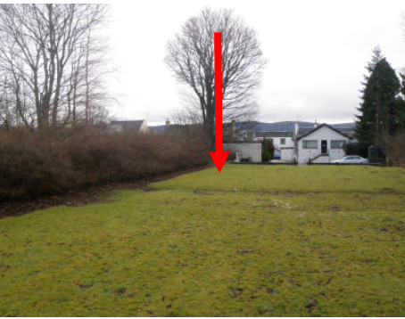
Fig. 3 : Proposed semi detached houses

3. The 18 proposed flatted units are identified on the indicative site plan as being accommodated within a number of structures. Two blocks of flats are proposed on land to the rear of Gladstone House, with each block identified to accommodate 6 units. This area of the site is currently separated from the main garden grounds of The Garth by a number of existing outbuildings (which would be demolished to facilitate the proposed development) and mature hedging. The area in which the two blocks of flats are proposed was traditionally associated with Gladstone House on Castle Road, which is situated outside the identified site boundaries. The area of the subject site is currently in an overgrown state. It is bounded to the rear by a high stone wall, which demarcates the boundary with an existing private access lane to the north adjacent to the police station. The footprint of each of the two blocks of flats is approximately 3 metres from the rear boundary at their closest point. A limited area of communal open space is proposed at the side of each of the two blocks.