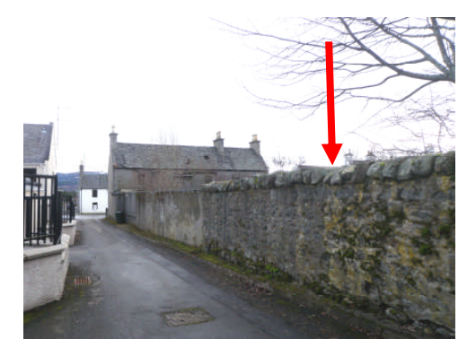
Fig. 4 : Boundary wall to the rear of 2 proposed blocks of flats

4. Moving in an anti clockwise direction around the site, the next element of the proposal is the erection of two dwelling houses, with the indicative site plan showing them in a semi detached form (on a west / east orientation) and located in the area which is currently set to lawn at the rear of the hotel car park. The western most unit would be positioned approximately 12 metres from the rear site boundary. Ground levels in the lawned area are higher than the adjacent car park or the residential garden ground to the north west. The boundary between the hotel lawn and the residential property (Netherby) immediately to the rear is currently demarcated by a timber fence and the property which lies to the north western corner of the site (Rosemount) is demarcated by a substantial hedgerow. The line of the hedgerow continues eastwards on the site, and currently acts as a demarcation between the hotel car park and grounds and the unused and overgrown area of land at the rear of Gladstone House.