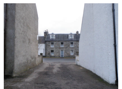
Fig. 9 : Access, as viewed from site