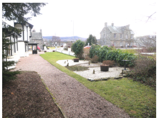
Fig. 7 : Pedestrian access and garden area to be retained to the south of the hotel