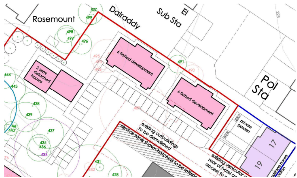
Fig. 10 : Extract from proposed site layout

The combination of issues arising from the level of development proposed in this area of the site are all clear indications that the proposal represents a significant level of overdevelopment.